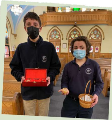
8th Graders lead us in our School Mass celebrating the Epiphany!