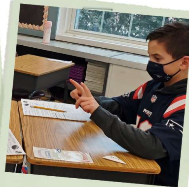
The Kick is good!