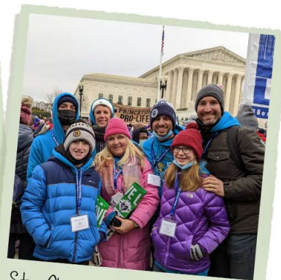
St. Augustine's School celebrates life in front of the Supreme Court!