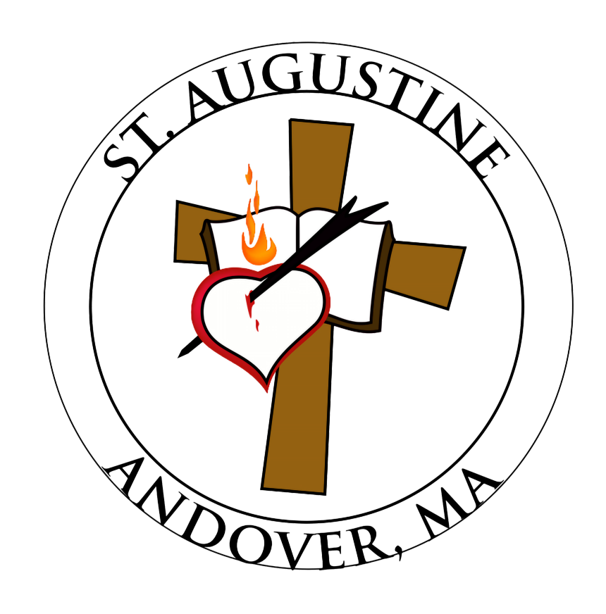
Forming Saints and Scholars